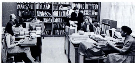
Catalog Room, Smithsonian Library