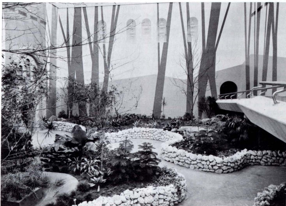
In the Central Flight Room of the Bird House, birds fly free in a simulated rain forest. Rods in the clear plastic ceiling have nozzles from which "rain" falls on areas planted with exotic trees and shrubs.