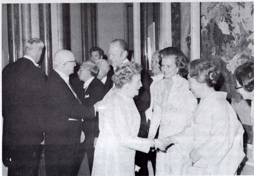
The Emperor and Empress and President and Mrs. Ford welcomed guests in a receiving line in the Great Hall of the Smithsonian Institution Building prior to the state dinner held in the SI Commons. Forty Japanese art treasures from the imperial collections, including five paintings by the Empress, were on view in the Great Hall.