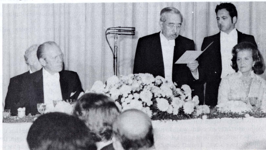
The Emperor addresses the guests from the head table.