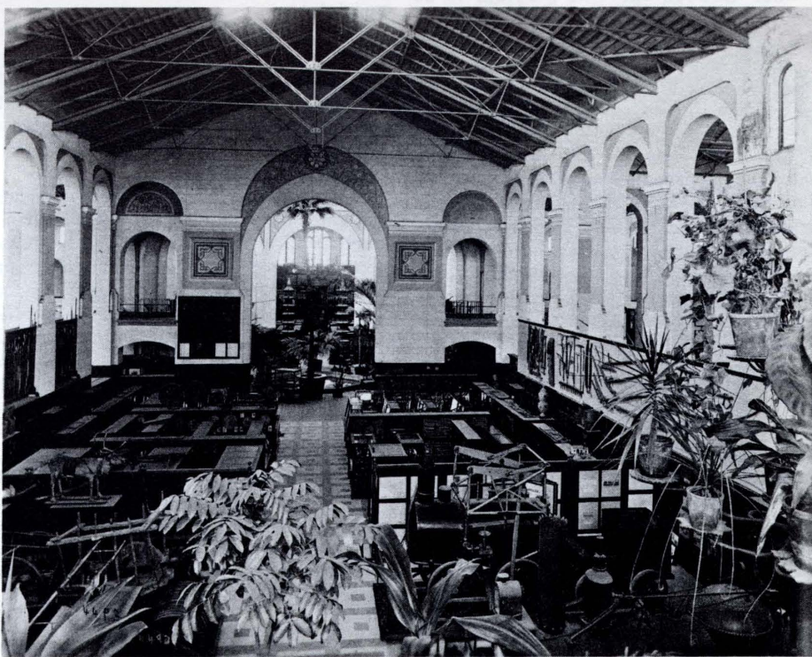
A view of the east exhibit hall in the Arts and Industries Building, taken in the 1880s, shows original wall stenciling above the arches in the hall and beyond in the rotunda. Stencilings like these will once again be applied to the A&I walls during the renovation. Some items on display then were the "John Bull" engine (extreme right foreground), presently on exhibit in the National Museum of History and Technology; farm implements; carts, and many others.