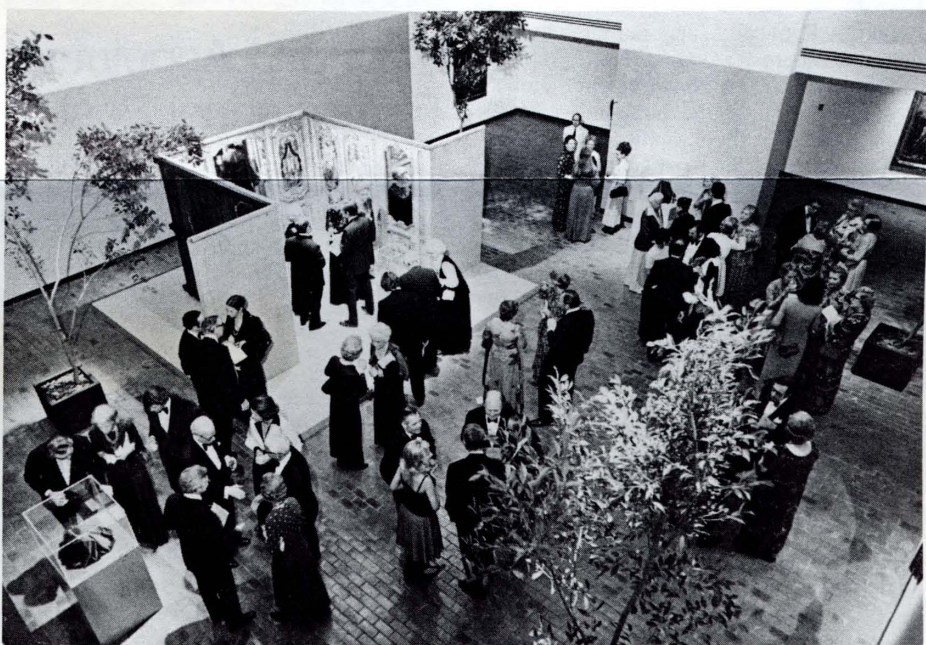
The French royal jewels from NMNH were displayed in this setting at Houston.