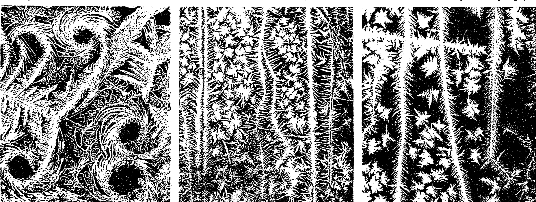
Reproduced with permission of the copyright owner. Further reproduction prohibited without permission.

When a natural dark ground is missing, the crystals must be placed before an object such as a sooted boiler or a pail blackened inside. In the instance of window frost the view of the actual creation of frost lens and camera are placed indoors crystals. So delicate is the balance facing the window, and a black of conditions necessary to their background is raised outside the window and a foot or two distant. This background should be just or in, disturbs their equilibrium and large enough and at the proper distance from the window so that it Although Jack Frost seems loath will barely darken the field of the hand may come after a cold, caim, river, Jack Frost's jewels become hat. Over there in another part of to reveal to us the secrets of the frost crystals to be photographed.