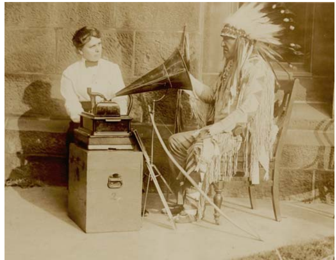
Mountain Chief, Chief of Montana Blackfeet, listening to song being played on a phonograph and interpreting it in sign language to Frances Densmore, 1916.