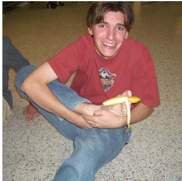
Students discover they don't have opposable great toes during the “Banana Day Challenge,” a popular activity.