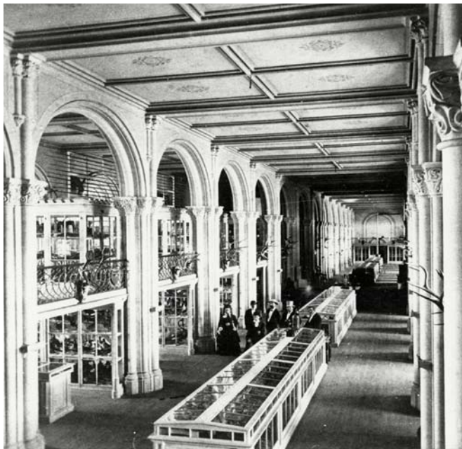
Exhibits in the Great Hall of the Smithsonian Castle, 1867.

the collections would use up the Smithsonian endowment and leave little or no money for basic research. He believed the artifacts and specimens were valuable for research, but that a museum would only have local impact and limited educational value. Feeling similarly about the library, Henry had it removed from the Institution in 1865 and sent to the Library of Congress (Rothenberg et al. 2002).