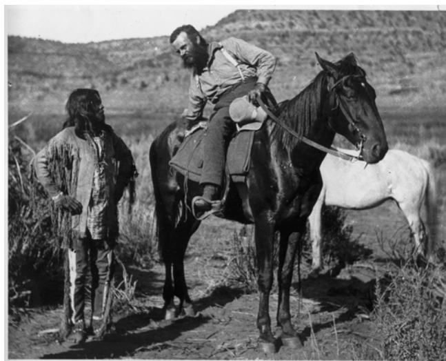
John Wesley Powell with a Paiute Indian near Kaibab Plateau.

In 1872, Powell was appointed a special commissioner of Indian Affairs and served as an informal advisor to Congress on Indian affairs, western land policy, and science policy. His Report on the Lands of the Arid Region