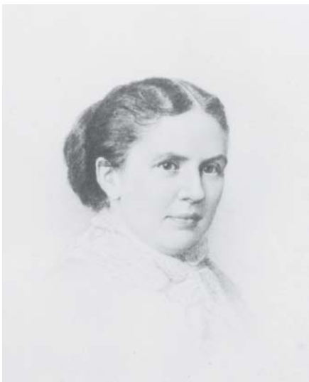
Alice Cunningham Fletcher.

At about the same time that Stevenson arrived at Zuni Pueblo, Alice Cunningham Fletcher took up the study of Indian culture. In 1879 she traveled from Boston to Omaha, Nebraska, to begin studies of Omaha culture. Fletcher loved the rigors of living in Indian villages and was motivated by a desire to improve Indian life. Her ethnological