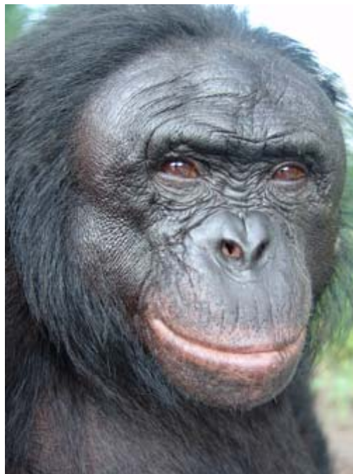
Kanzi.

tional beings: happy Neanderthals, sad Neanderthals, angry Neanderthals, disgusted Neanderthals, envious Neanderthals, guilty Neanderthals, grief-stricken Neanderthals, and Neanderthals in love.” To project “love” into the past takes a cautious approach, to be sure, but to consider critically the subject, and how researchers might look for evidence of emotions, is warranted for a full evolutionary perspective on human behavior. In my most recent book, I have even suggested that ape and early-human emotion, communication, and cognition point us towards recognizing the deepest roots of what later became human religiosity.