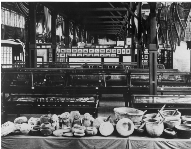
Anthropology exhibit at the Philadelphia Centennial Exposition, 1876.

But Holmes had become fascinated by the Native American materials he encountered out West. His artistic eye was soon analyzing ceramics and other artifacts for patterns and relationships. He was named a curator of anthropology in the National Museum. In 1889 he joined the staff of the Bureau of American Ethnology, but soon left for the Field Museum in Chicago. He returned to di-