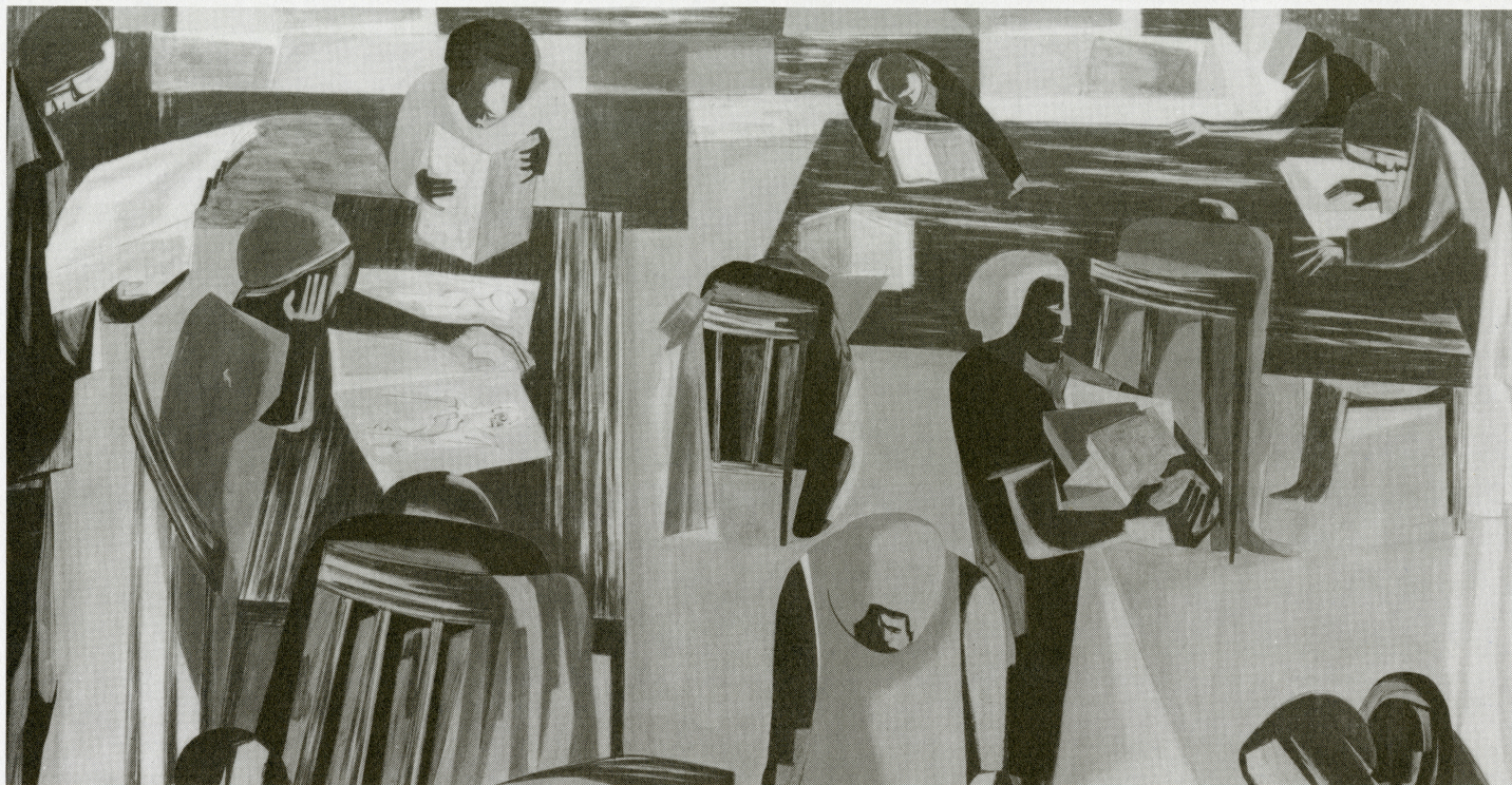
Jacob Lawrence, The Library, 1960.

Education is learning all that is worthwhile knowing, not to be crammed with the subject matter of the book or the philosophy of the classroom, but to store away in your heads such facts as you need for the daily application of life, so that you may be better in all things, understand your fellow man and interpret your relationship to your creator....You must never stop learning. The world's greatest men and women are people who educated themselves outside of the university with all the knowledge that the university gives, and you have the opportunity of doing the same thing the university student does — read and study.