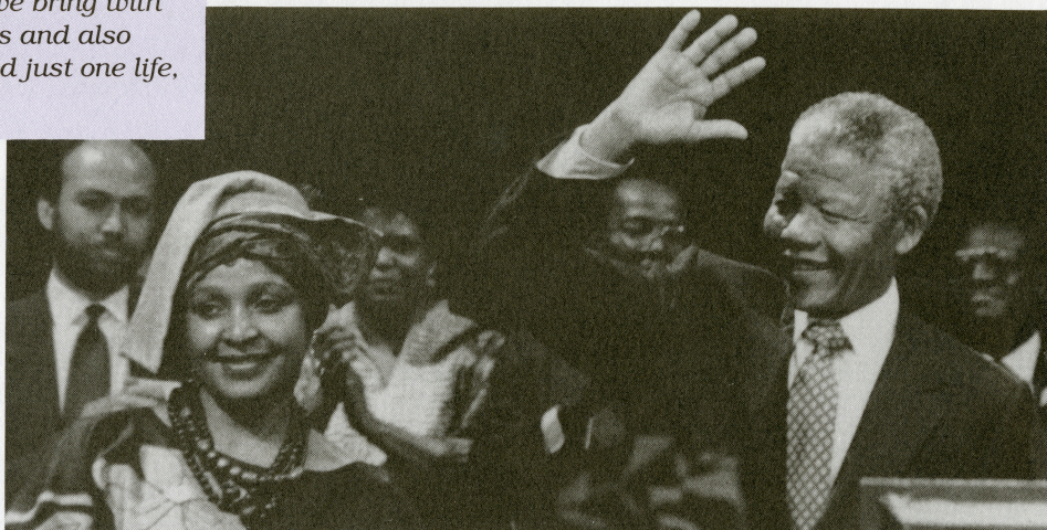
South African leader Nelson Mandela and wife Winnie Mandela

Suddenly, I am chilled because my memory is unable to flee the sounds of