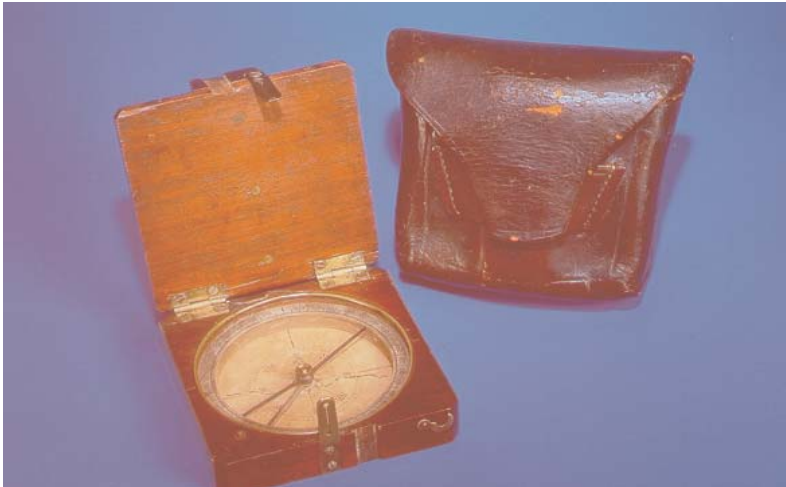
This compass was used by Meriwether Lewis and William Clark on their expedition in 1804 to explore the new Louisiana Purchase. President Thomas Jefferson's purchase of land from France doubled the size of the United States. National Museum of American History.

The National Museum of American History dedicates its collections and scholarship to inspiring a broader understanding of our nation and its many peoples. The museum creates learning opportunities, stimulates imaginations, and presents challenging ideas about our country's past.