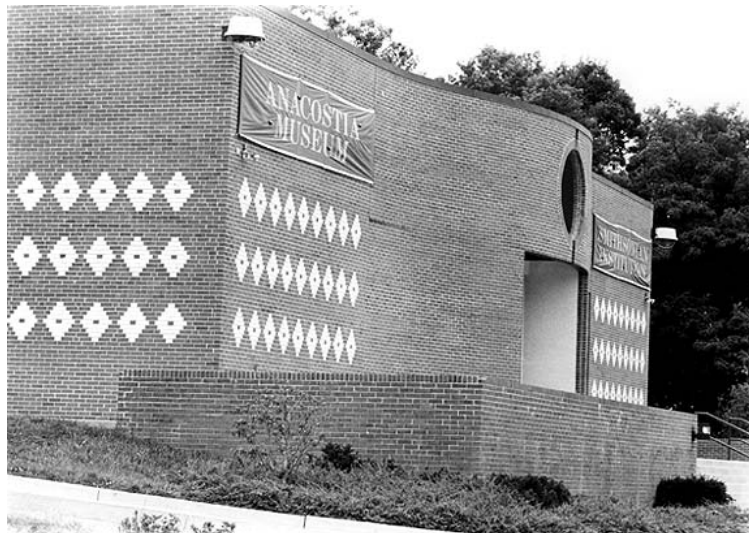
Anacostia Museum, Smithsonian Institution.

The Anacostia Museum and Center for African American History and Culture are dedicated to increasing public understanding of the experiences and creative expressions of people of African descent living in the United States and the Americas. The museum offers exhibitions, educational programs, publications, and special events to serve local, national, and international constituencies.