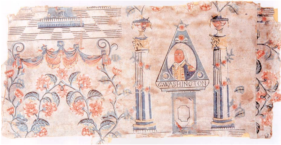
Wallpaper: a memorial to George Washington, unknown American Manufacturer, c. 1800, block printed. This rare fragment of American wallpaper was produced after Washington's death in 1799. It is one of two known wallpapers produced to commemorate our first president. Cooper-Hewitt, National Design Museum.

The Cooper-Hewitt National Design Museum seeks to enrich the lives of all people by exploring the creation and consequences of the designed environment. Through its activities, the museum stimulates creative thinking and promotes openness to new ideas; makes information about design physically, intellectually, and culturally accessible to a broad public; provides a global forum for experimentation and discourse on design issues; serves new audiences; and inspires others to value human achievements in design.