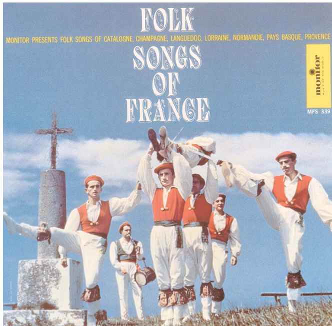
One of the recordings in the Monitor Recordings Collection, recently acquired by the Ralph Rinzler Folklife Archives and Collections, Center for Folklife and Cultural Heritage.

The Center for Folklife and Cultural Heritage and the Ralph Rinzler Folklife Archives and Collections focuses on the expressive traditions of communities in the United States and worldwide. The Center organizes, preserves, and provides access to the Rinzler Archives by preparing cata-