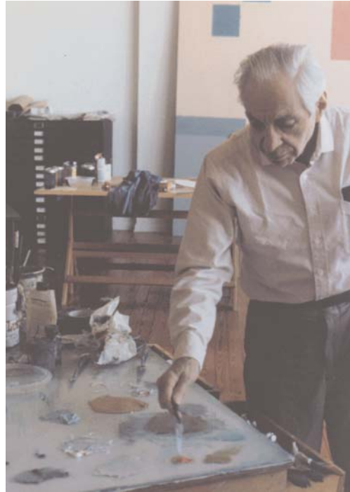
This image is of Jacob Kainen in his studio, New Market, Maryland, Spring 1986.

The Archives of American Art is a national research repository with reference centers and associated research facilities available at several locations around the United States. The Archives is the world's largest single source of archival materials on the history of the visual arts in the United States. The Archives actively collects, preserves, and microfilms original source materials for study and encourages research in American art and cultural history through publications, symposia, lectures, and other public programs.