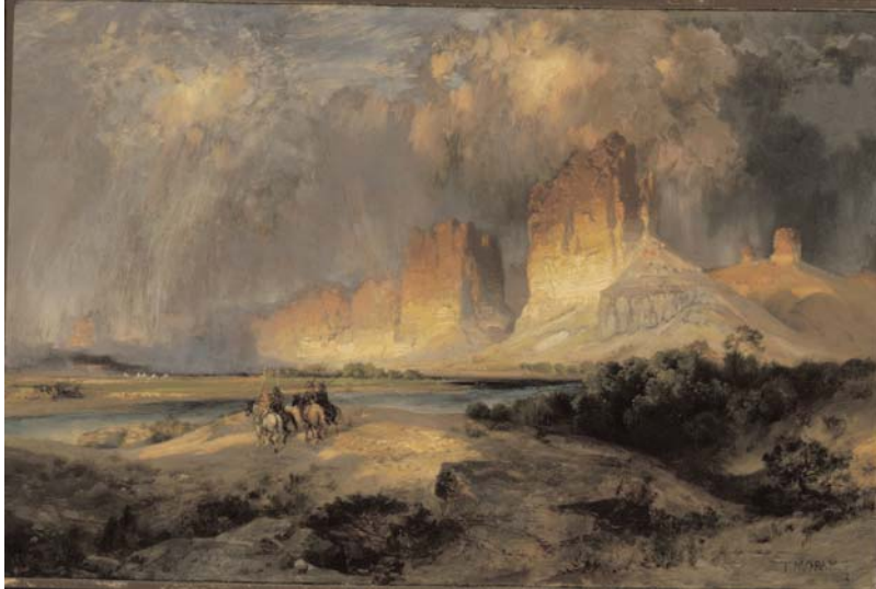
"Cliffs of the Upper Colorado River, Wyoming Territory". Thomas Moran, 1882, oil on canvas. Smithsonian American Art Museum.

The Smithsonian American Art Museum, formerly the National Museum of American Art, is the nation's museum dedicated to the arts and artists of the United States from colonial times to the present. The museum serves audiences throughout the nation, as well as those who visit its two historic landmark buildings in Washington, D.C. It presents for a broad public its collections, educational materials, and research resources, which reflect the diversity of the country's citizens.