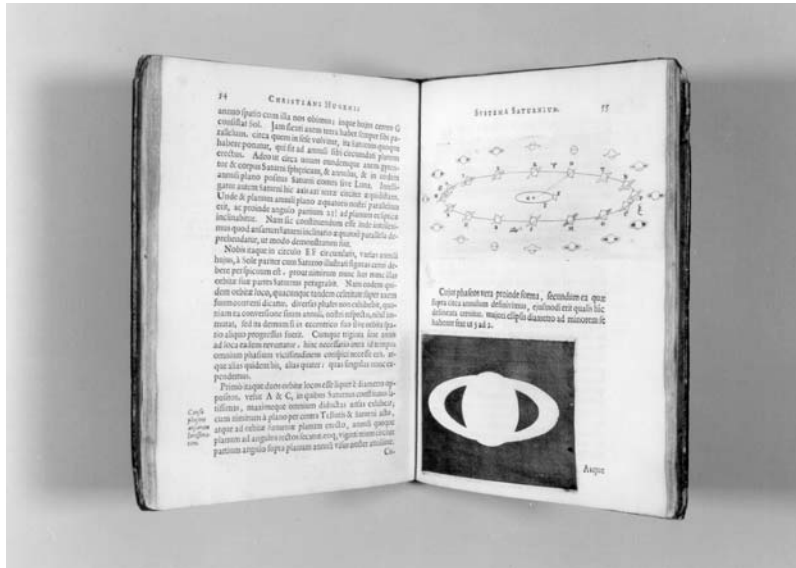
Systema Saturnium ( The Saturnian System) by Christiaan Huygens, c. 1659.

The Smithsonian Institution Libraries make information in all forms available to Smithsonian scientists, historians, curators, staff, and others with research needs. The libraries accomplish this by building, organizing, managing, housing, and preserving collections; providing reference services; and employing appropriate technologies for finding and disseminating information. The libraries offer educational opportunities that include exhibitions, internships and professional residencies, publications, lectures, user instruction, and Web sites with specialized reference information. The catalog is at www.siris.si.edu .