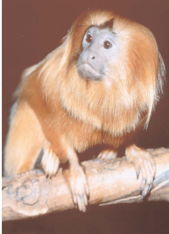
The National Zoo pioneered the reintroduction of golden lion tamarins into the forests of Brazil. To date, more than 250 of these small monkeys have been born in the wild to reintroduced parents originating at zoos around the world.

The National Zoological Park (NZP) was established in 1889 “for the advancement of science and the instruction and recreation of the people.” The Zoo, as envisaged by its supporters was to be a refuge for vanishing North American species. But, funding complications combined with people’s desire to see exotic or performing animals, gave rise to a public collection that included non-native species such as Asian elephants, as well as bison captured on the American plains. The mix of animals continues in the present collection, which contains species from across the globe and down the street.