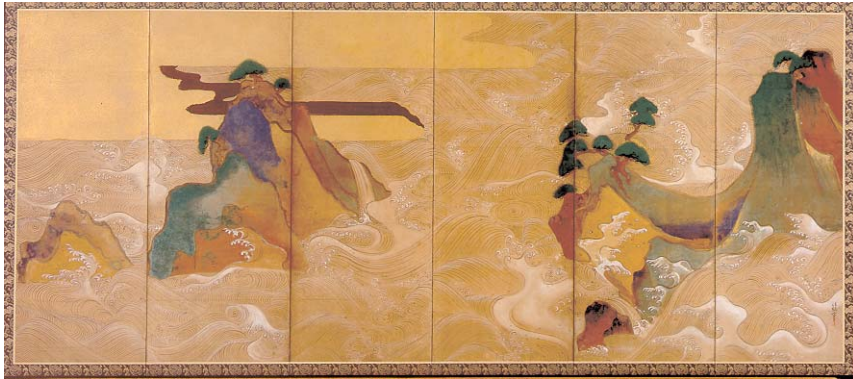
Waves of Matsushima by Tawaraya Sotatsu (active 1614-1639), Japan, Edo period. Pair of six-fold screens; ink, color, and gold on paper. Arthur M. Sackler Gallery.

The Freer Gallery of Art and the Arthur M. Sackler Gallery study and celebrate the artistic traditions of the peoples of Asia. Administered by a single staff, the two museums form an internationally important center dedicated to maintaining the highest standards for the collection, preservation, study, and exhibition of Asian art, as well as for educational programs that advance public understanding of the meanings and values embodied in the artistic traditions of Asia.