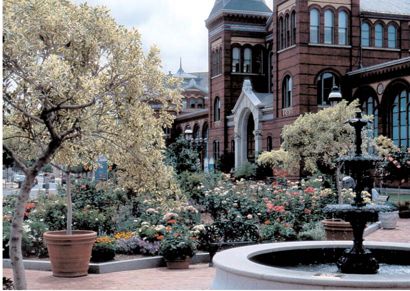
Katherine Dulin Folger Rose Garden. Dedicated in 1998, the Folger Rose Garden is one of the many gardens where pieces of the garden furnishings collection are on display. Horticulture Services Division.

The Horticulture Services Division is dedicated to increasing the public's awareness, understanding, and appreciation of horticulture and gardening. This mission is accomplished through the display gardens, interior plant landscaping, and greenhouse nursery operation, and through its collections of living plants, floricultural memorabilia, and garden furnishings and images. Educational tours and programs based on the gardens and collections are presented throughout the year by staff, interns, and fellows.