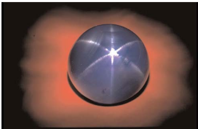
The Star of Asia Sapphire, part of the National Gem and Mineral Collection, is currently on display in the Janet Annenberg Hooker Hall of Geology, Gems, and Minerals.

The National Museum of Natural History seeks to foster understanding of the natural world and humanity's place in it. The museum's research programs study natural and cultural diversity by collecting and identifying things that exist in the natural world, establishing the relationships between them, and explaining the underlying processes that generate, shape and sustain their diversity. The museum's public outreach shares this scientific understanding through exhibitions and education programs.