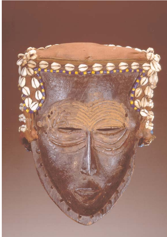
Mask, Lele peoples, Ilebo area, Democratic Republic of the Congo Wood, copper, iron, pigment, fiber, cotton, wool, cowrie shells, glass beads, 28 cm (11-1/6 in.)

traditions of all African peoples. The collection, which consists of 7,400 objects dating from antiquity to the present, includes traditional masks and figures, textiles, costumes and jewelry, furniture and household objects, and architectural elements, as well as modern sculpture, paintings, prints, and ceramics.