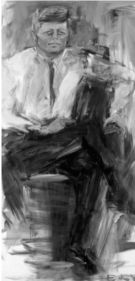
John Fitzgerald Kennedy, 1917–1963 Thirty-fifth President of the United States. Elaine de Kooning, oil on canvas, 1963. National Portrait Gallery.

Established by Congress in 1962, the National Portrait Gallery opened to the public in 1968. Its mission is unique among American museums. During the past three decades, the permanent collection has developed significantly through purchase, gift, and bequest, today numbering more than 19,000 portraits in a variety of media. The collections and exhibitions are interpreted to the public through lectures, dramatic and musical programs, films, and a World Wide Web site.